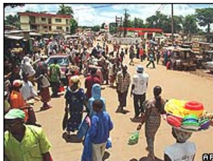
Kindia (Guinea) Market Place

6:30am to 7:30am - Breakfast 8:00am to 12:00pm - Dance and Drum Instruction 12:00pm to 1:00pm – Break 1:00pm to 2:00pm – Lunch 2:00pm to 3:00pm – Break 3:00pm to 6:00pm - Dance and Drum Instruction 8:00pm - Dinner